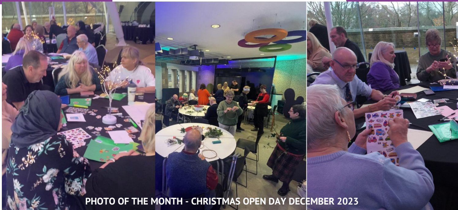
PHOTO OF THE MONTH - CHRISTMAS OPEN DAY DECEMBER 2023